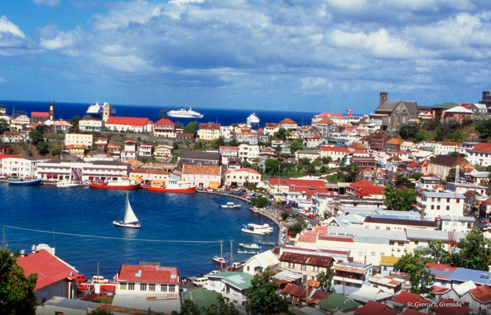
St. George's, Grenada