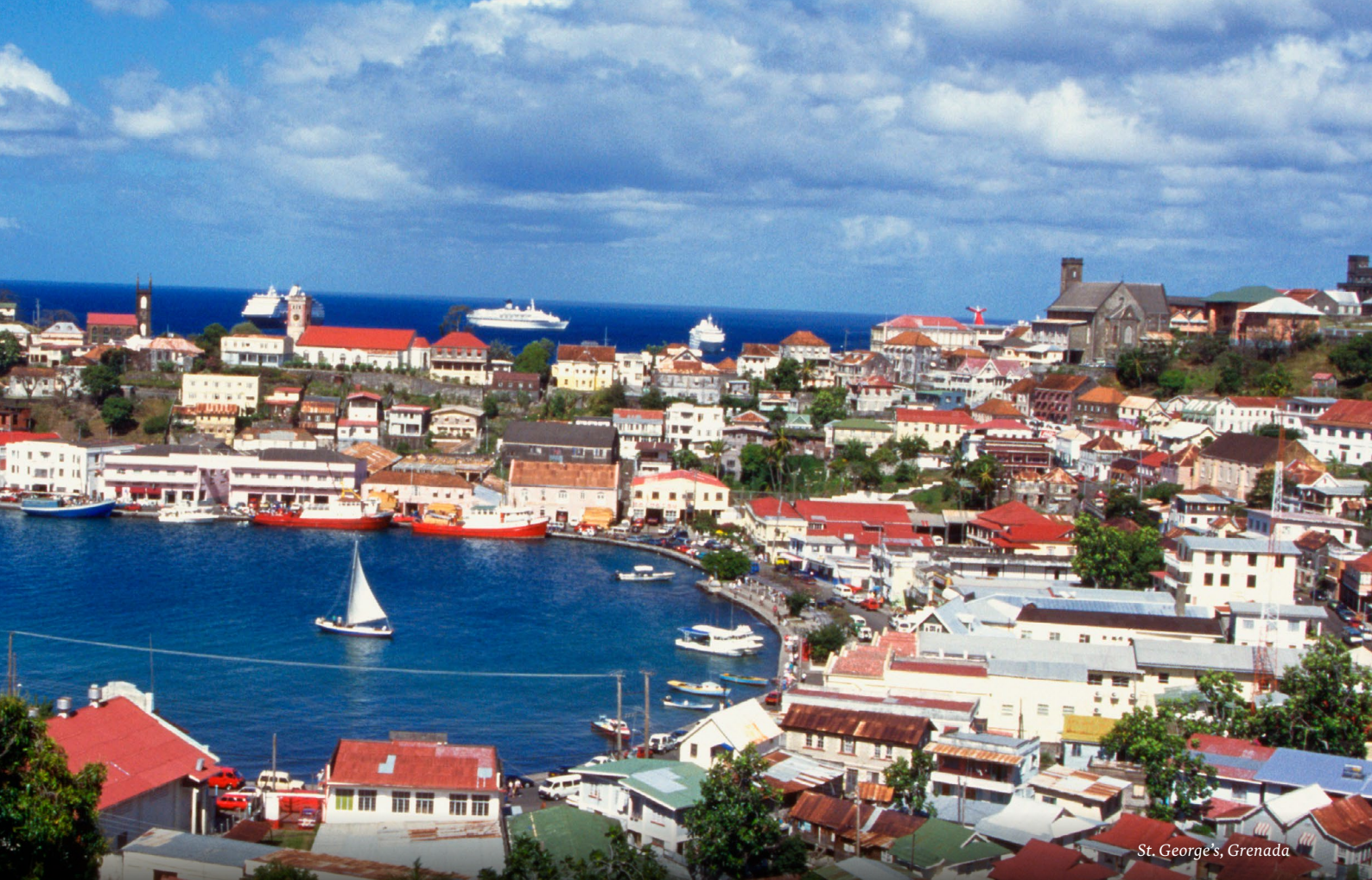
St. George's, Grenada